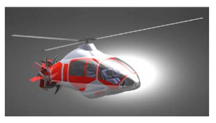
The conceptual ArrowHawk 6 gyroplane can be sized for six to nine seats in single-engine configuration and 10 to 16 seats in multi-engine form, depending upon market demand.

Cancellation of the Rotodyne in 1962 has been blamed in part on tip-jet noise that precluded operations from urban vertiports.