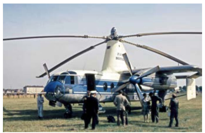
The Fairey Rotodyne (a legacy Westland demonstrator) first flew in 1957 and set a world speed record: flying at an average of 190.9 mph (307.2 km/h), over a 60-mile (100 km) closed circuit.

Former US Army helicopter pilot and Vietnam veteran David Groen observed, "One of the things we've struggled with these last 32 years, when we get industry partners lined up ... before they invest, they talk to someone from the helicopter world who they believe would know everything about gyroplanes. The helicopter