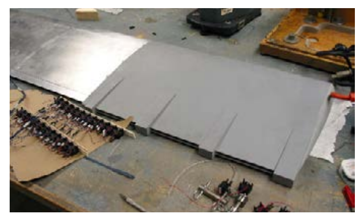
Heliplane researchers also tested a full-size blade tip model.

Skyworks Global/Groen Brothers Aviation has drawn plans for ArrowHawk gyroplanes big enough for 6 to 16 passengers; each could also be designed in gyrodyne form. Company analyses indicate autorotative flight aircraft up to 150,000 lb (68,000 kg) gross weight are possible; larger aircraft have not been studied so far, but even its ultra-heavy "GyroLifters" promise the hover and VTOL capability of smaller gyrodynes. Analyses also conclude because bigger GyroLifters would need more blades, longer blades and more tip jets — thrust per pound of aircraft per blade tip would decrease as aircraft size increases. Tip jets are admittedly less fuel-efficient than helicopter drivetrains, but would be used only for hover and VTOL operations.