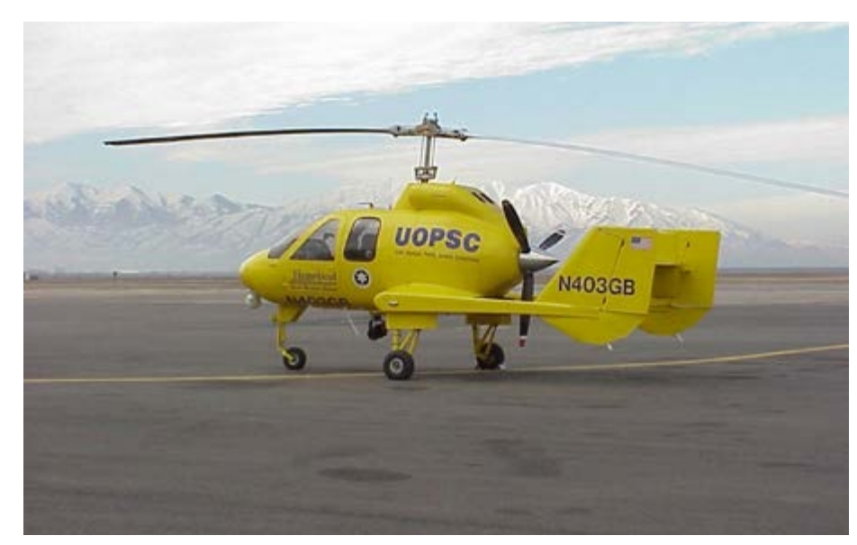
The Hawk 4 flew in support of the Salt Lake City Olympics in 2002. Skyworks Global plans to productionize the Hawk 4 gyroplane with improvements for the international market.

showed the worst design errors in accident-prone gyrocraft of other manufacturers were in the misplacement of rotor and propeller thrust vectors as related to aircraft center of gravity. Groen designed the hands-off stable SparrowHawk to fix the safety issues of kit gyroplanes.