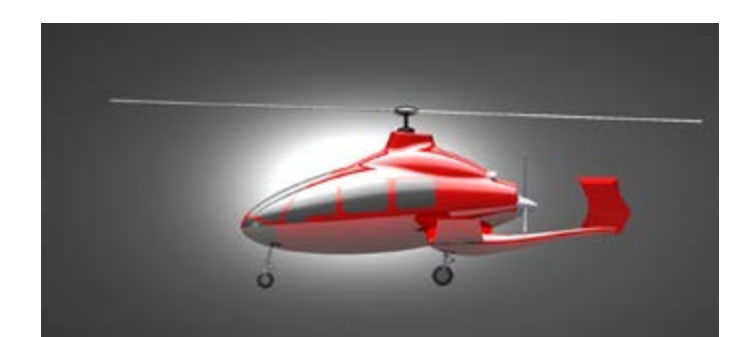
Concepts for Skyworks Global's gyroplanes are sized to carry four to six passengers and are tailored to markets without aviation infrastructure.

performance improved dramatically by being able to change collective pitch during descent. Collective pitch control could enhance gyroplane safety, especially in less-than-1G maneuvers. Collective pitch also enables gyroplanes to spin-up on the ground at flat pitch, store energy in the rotor, and take off vertically with rapid collective input as the aircraft accelerates. In addition, it provides a means to optimize rotor speed for greater cruise efficiency. The stable SparrowHawk III entered production without collective control for business reasons. However, collective pitch control will be introduced on the SparrowHawk IV and offered as an improvement kit for the earlier aircraft.